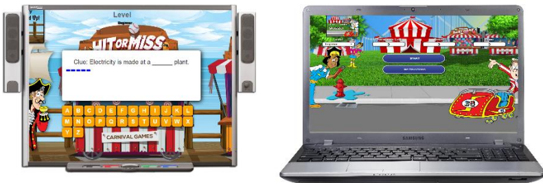
Digital Classroom Materials

Along with the 40-minute in-school performance, digital classroom materials are provided and energy efficiency kits are available for the homes of staff and students.