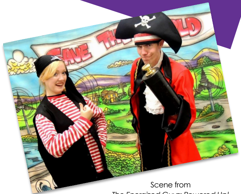
Scene from The Energized Guyz: Powered Up!